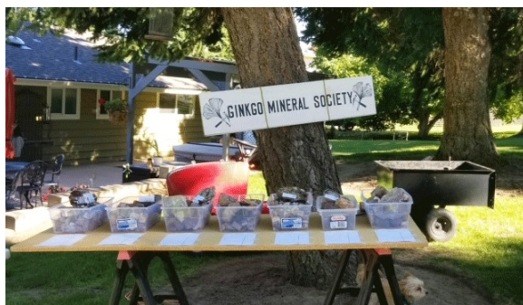
A fun time for Ginkgo