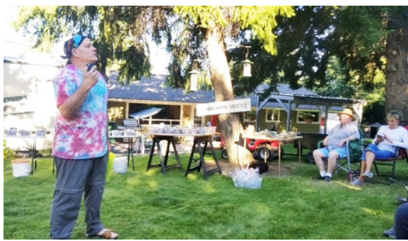
Call to order