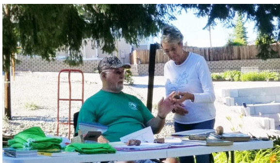
Consultation on identifying a rock