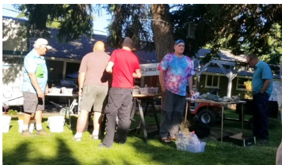
Browsing the selection of goodies