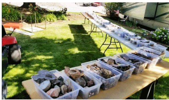
Lots to choose from for the silent auction