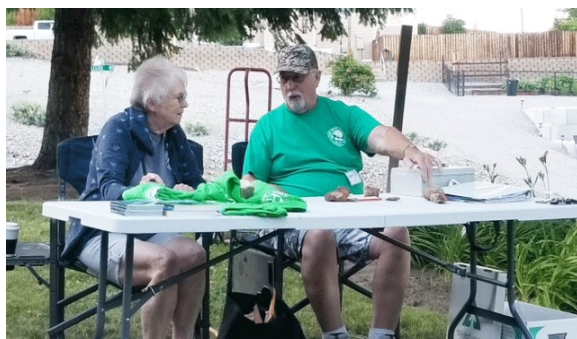
Ready to sell t-shirts and collect money