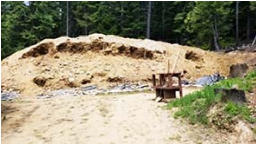
Pay pile collected by Forest Service from surrounding creeks