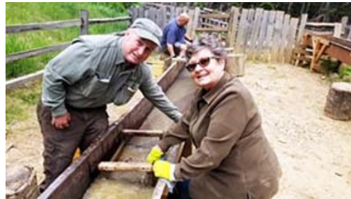
After screening out the sand and dirt, the pay material is sluiced to look for the purple gems