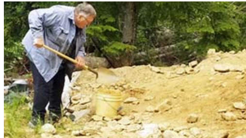
Filling a bucket to take to screening area