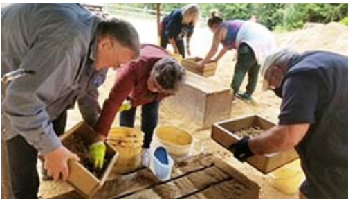
Screening out sand and dirt and big rocks