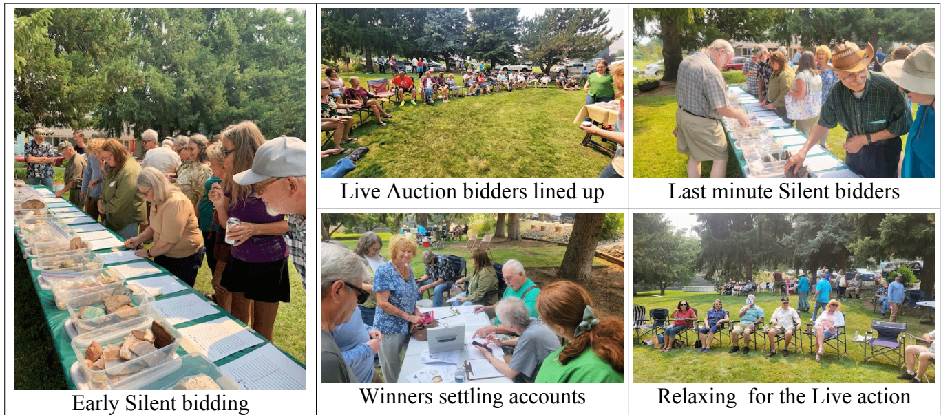
Early Silent bidding